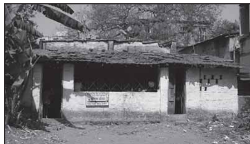
Small local school.

giving the necessary care. Today a few hundreds families are followed and benefit from various types of support. With its 30 years of experience, the Spastic Society is there to teach other NGO's, what daily care and education can be given to cerebral palsy children (CP). More than 300 teachers and social workers participate in training courses that enables them to approach, with confidence, these «different» children. They learn how to facilitate the integration of these children in the small schools of the district. The parents are also shown how to obtain official documents, as «disability card» and get a small governmental pension.