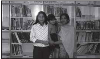
The happy librarians.

Also necessary, was the construction of closed shelving, in order to protect the books from the ever-present Indian dust. All these improvements were carried out with MIBLOU's financial support.