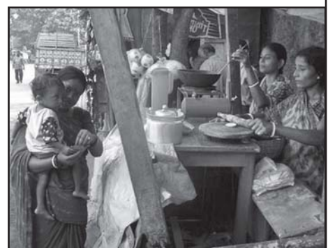
The tea shop

This experiment is so positive that five new mothers have already started tailoring training and soon will be able to open their own shop, with the obvious economic advantages resulting from it.