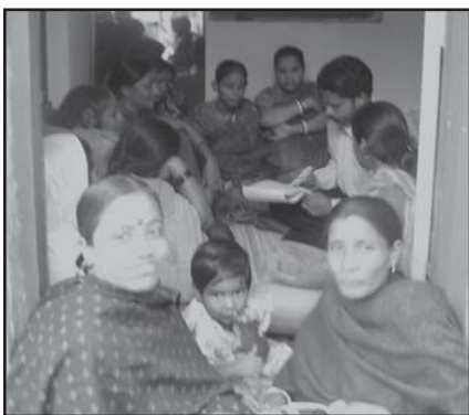
The self help group

In the slum, mothers of disabled children, generally illiterate and without any training organised a "self-help group". They benefited from microcredits, which will gradually enable them to step up from poverty. This is included in the "Spastic Society" the programme, which is supported by MIBLOU.