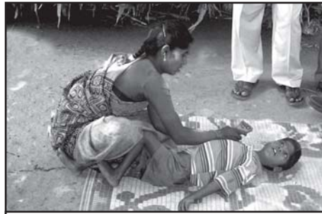
Therapy in the village

survey. 45 of these NGO's did not even include "disability" in their health programmes. The results of this study on disabled women showed, among other results, they were very strongly discriminated. The woman in the Indian society is generally not valued enough, therefore, if she carries a disability, she's even more vulnerable, is rejected and is seen as a burden for her family who find it difficult, if not impossible, to get her married.