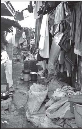
Visit to the slum

so that these children can be officially recognized, because more than one third of newborns in India are never registered at birth. They can neither, prove their birth date, their name, nor their nationality. Civil birth registration confers a legal identity and facilitates access to health and education systems. Once registered disabled children will receive, a disability card that allows them to obtain government support.