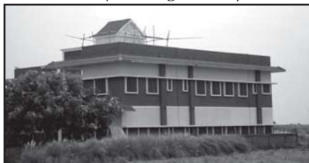
The new home

Certain children must undergo important orthopaedic surgery that will enable them to walk one day. This means a long period of convalescence with care and physiotherapy. It cannot be done in the family hut, generally due to