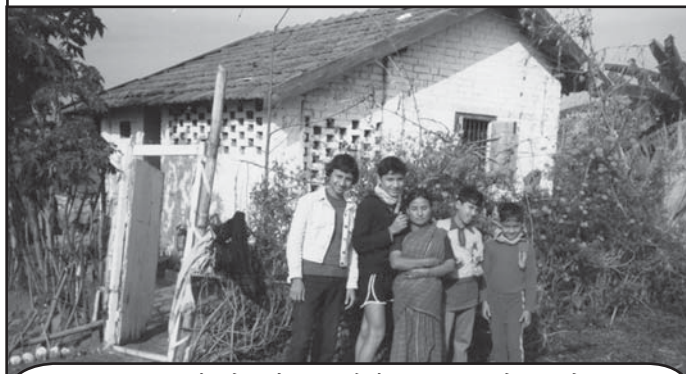
1983: the four boys and their mom in front of the first brick house sponsored by MIBLOU

Once upon a time, in 1980, in a small bamboo hut in the North of India, a poor woman was alone raising her four sons. She had a small employment in a poor rural hospital and with her small income could hardly manage to feed her children more than a bowl of rice. One day, her road crossed the one of MIBLOU and at this point it changed her life. A better future was in view for her children. The four boys were sponsored during numerous years. Education was provided; all finished their studies successfully, and entered in the professional life.