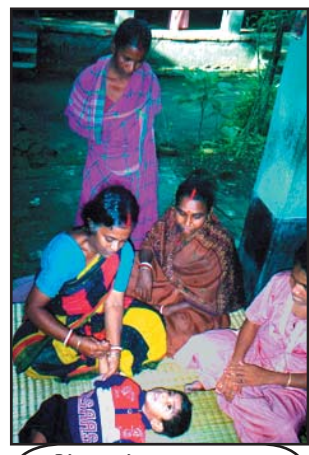
Physiotherapy session in the village

During the past fifteen thousands children have benefited of these methods, which improved, with time, and have been adapted to today's way of living. In the areas where MIBLOU works, the children are not hidden in their huts any more; on the contrary they are now integrated in the local schools according to their capacities. They do not crawl around on