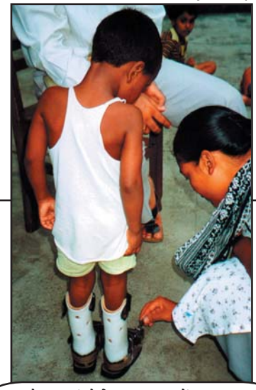
Last trial for new appliances.

In 2005, the opening of the new orthopaedic workshop in the home for polio children in Uluberia was a joy for all. The children of the home will not have to travel hours by bus to go to Kolkata, in order to repair their appliances or to take possession of the new ones. This workshop is also opened to outside patients, a good way to use it at the maximum of its capacity.