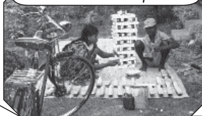
A stack of wire brushes ready to deliver