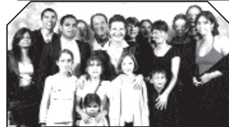
Behind Miblou – the Millar family

Case Postale 697 CH -1214 VERNIER (GE) millar.miblou@eurospan.com