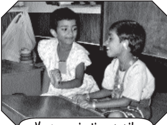
Very conscientious pupils

Muktadara, a MIBLOU partner in Hooghly District, West of Kolkata, look after 475 disabled children aged from 0-18 years throughout the forty villages. Muktadara in its CBR work offers a wide variety of assistance, such as getting disabled children integrated in the local school system, physiotherapy, speech therapy, ortho-appliances, hearing aids, or eyeglasses. Vocational training, and small loan programmes allow young adults to open a shop or small workshop.