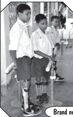
Brand new leg supports