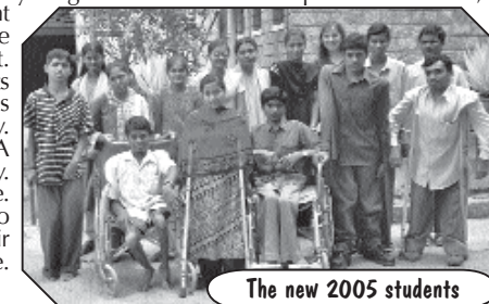
The new 2005 students

This summer the batch of 30 students sponsored by MIBLOU finished their year's training with flying colours. Twenty-five have already found jobs and five will continue their studies. Our hearty congratulations from us and sponsors. MIBLOU, happy that this experiment has been successful, is more than willing to repeat it. Twenty-five new students are already enrolled in this chance-of-a-lifetime bursary. A chance to learn a trade. A chance to earn a decent salary. A chance for independence. But most important a chance to show they can overcome their disability. A great example.