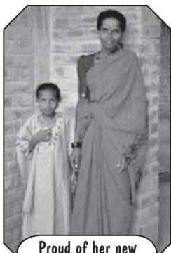
Proud of her new hearing aid