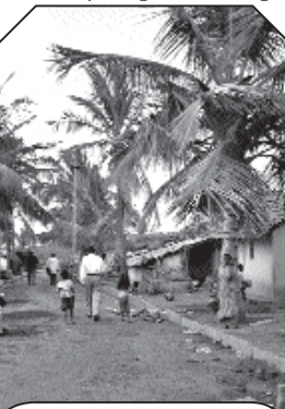
Gramina helper visiting a village

MIBLOU too has invested in the future with Gramina too. We are financially participating in the construction of a small rehabilitation centre to be used for physiotherapy. This includes an ortho-repair workshop. Another room will be used for CBR meetings, medical dispensary, office and conferences.