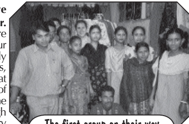
The first group on their way to autonomy

The foremost and innovative organisation in Kolkata is Sanchar. Our partnership goes back more than 20 years. But over the past four years MIBLOU has been financially supporting a group of 15 young adults, most are hearing impaired. And in that time they've learnt the techniques of embroidery and sewing. Today the quality of their work is of such a high standard they have been selling it very successfully. With the help of some parents, these young people have set up a cooperative. Meanwhile another group has started on the same training scheme. When ready they will join the first group in the cooperative.