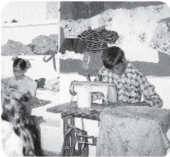
Training in tailoring

Sanchar began its work thanks to the support of MIBLOU, many years ago. It is therefore with pleasure that MIBLOU included them in its “Action 2000”. Their CBR programme of support to the families of disabled children in villages around Calcutta helps to avoid abandon of these children by their families. Here too, twenty young people suffering from physical or mental problems will begin a sewing class, the manufacture of paper accessories or of wooden toys. The programme includes the participation of parents in a small co-operative that will help sell the handiwork made by their children.