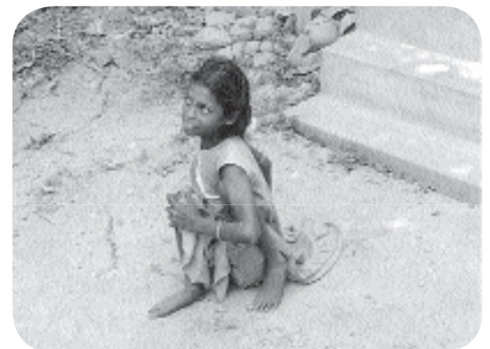
The life of so many children: crawling on the ground